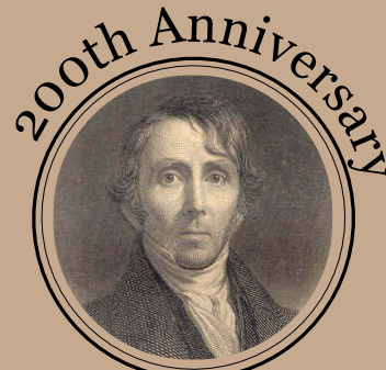
of Channing's sermon "Unitarian Christianity"